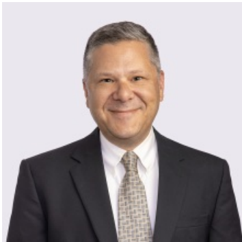
Eric R. Magnus

The Senate Committee on Health, Education, Labor, and Pensions has released its version of the Build Back Better bill and it does not contain the provision regarding class or collective action waivers in the version passed by the U.S. House of Representatives on November 19, 2021.