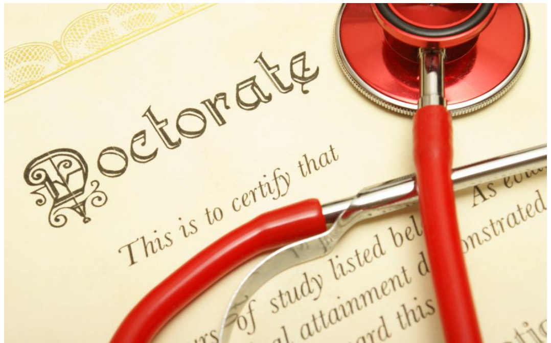
Keeping Pace with Industry Concerns: Peer Review and Credentialing