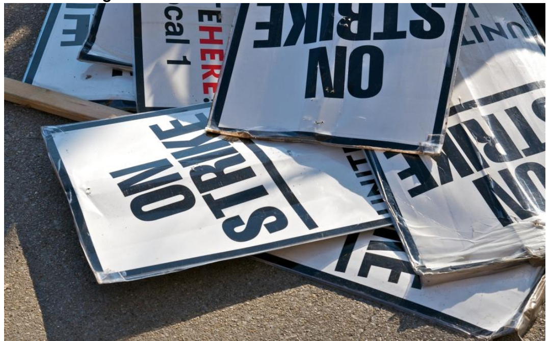
Keeping Pace with Industry Concerns: Labor Issues in Healthcare