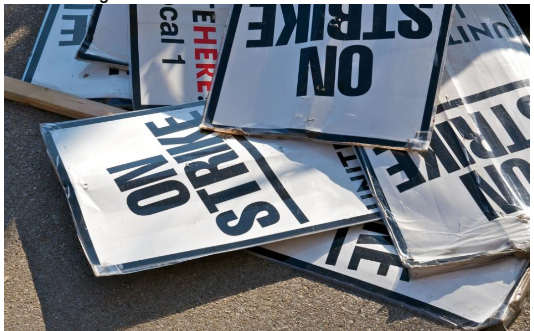
Keeping Pace with Industry Concerns: Labor Issues in Healthcare