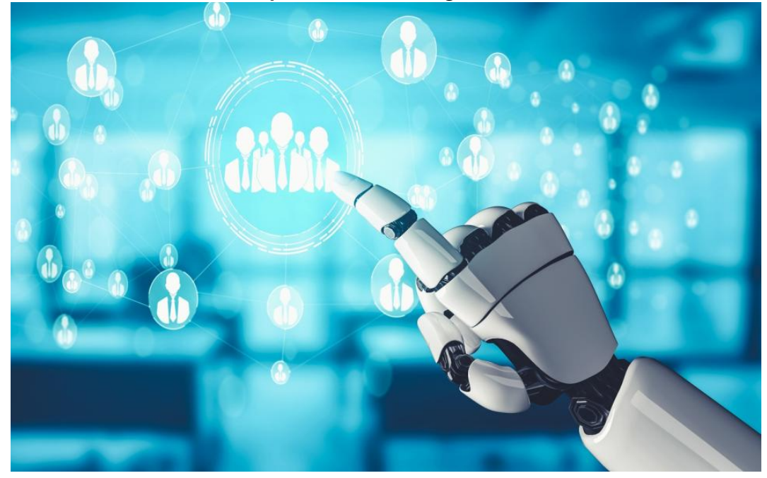
EEOC Files for Consent Decree Settlement in AI Discrimination Case