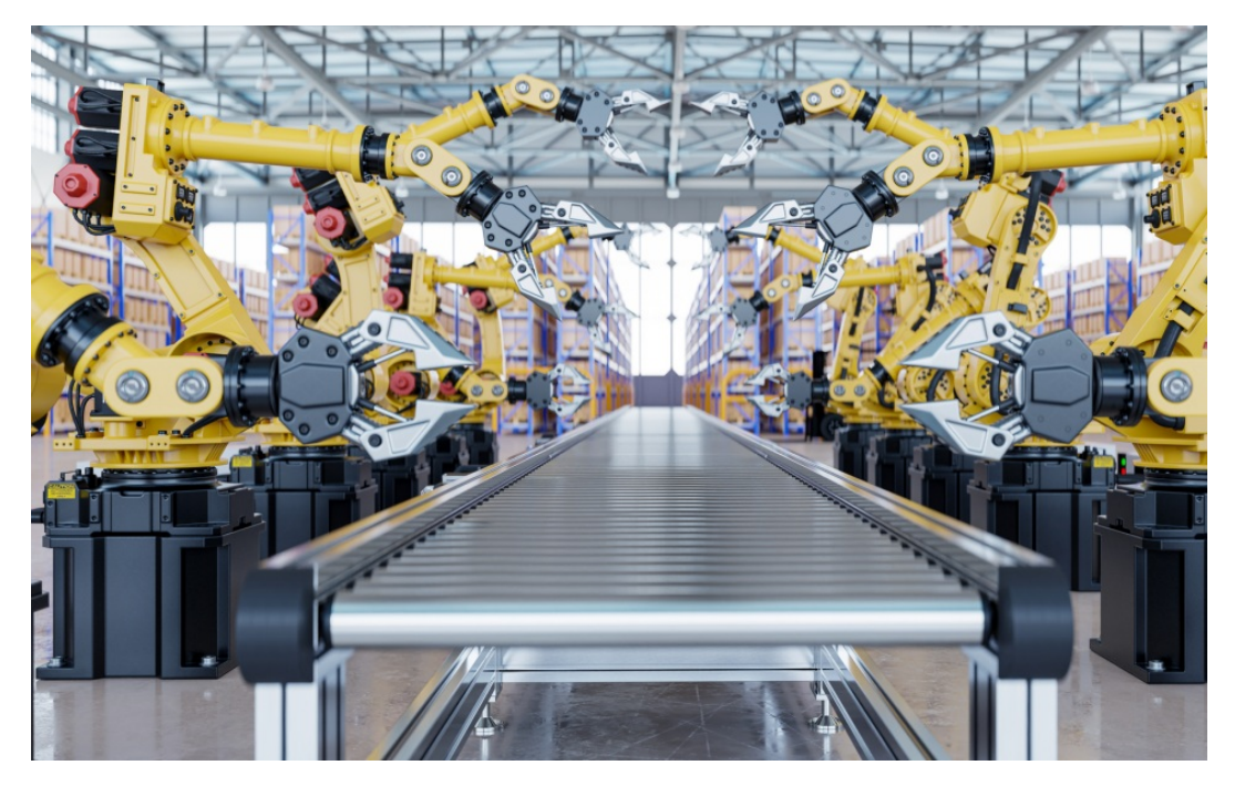
Al in the Manufacturing Workplace: Can 'Big Brother' Keep Employees Safe?