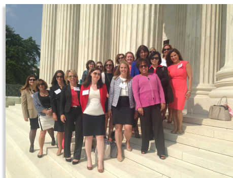
D.C. REGION OFFICE WIN EVENT—ON THE STEPS OF THE U.S. SUPREME COURT

On June 10 th , the D.C. Region office hosted its annual WIN event. The evening started with an intimate, Justice-designated tour of the United States Supreme Court, including a tour of private spaces used by the Justices. After the tour, we walked to Sonoma Restaurant and Wine Bar for cocktails and appetizers. Guests included senior counsel for major firm clients.